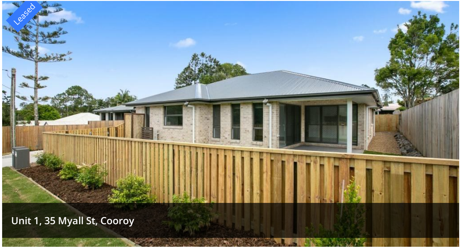
Unit 1, 35 Myall St, Cooroy